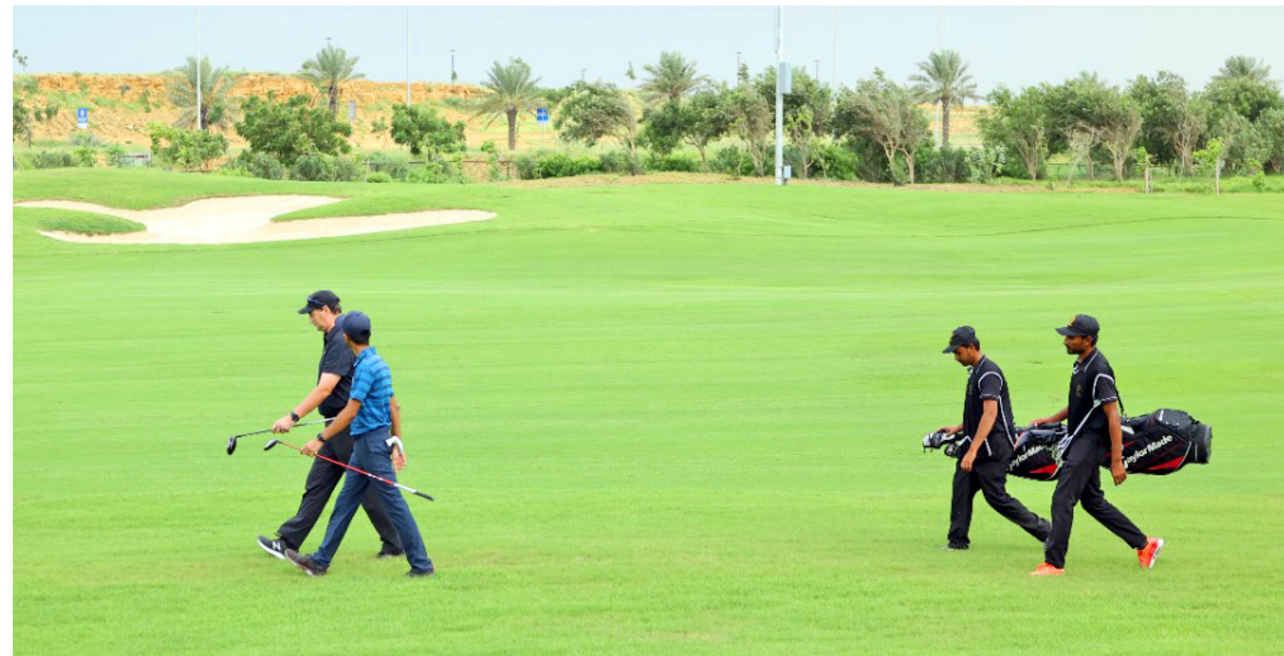
Rayhan Hills Golf Club, Bahria Town Karachi

At Bahria Town, we shape experiences that inspire and enrich, offering a world where every moment is filled with harmony and balance. With features prioritising luxury, convenience, and well-being, we ensure that every aspect of life is effortlessly elevated to the highest standards — ensuring you have everything you need to make your world go round.