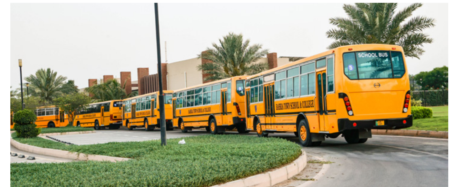
Schools & Colleges - Bahria Town