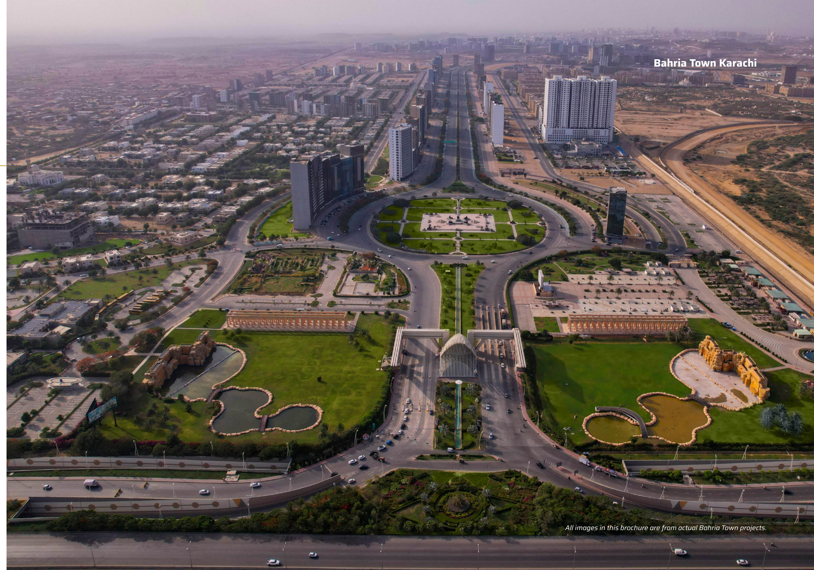
All images in this brochure are from actual Bahria Town projects.