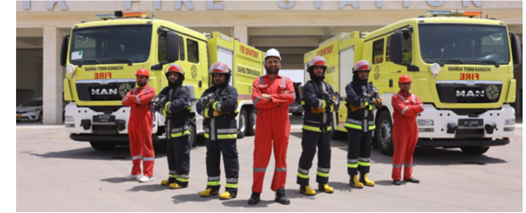
Fire Brigade, Bahria Town Karachi

We believe in shaping brighter futures through education. Our world-class schools and colleges foster holistic learning, empowering children to grow and reach their full potential.