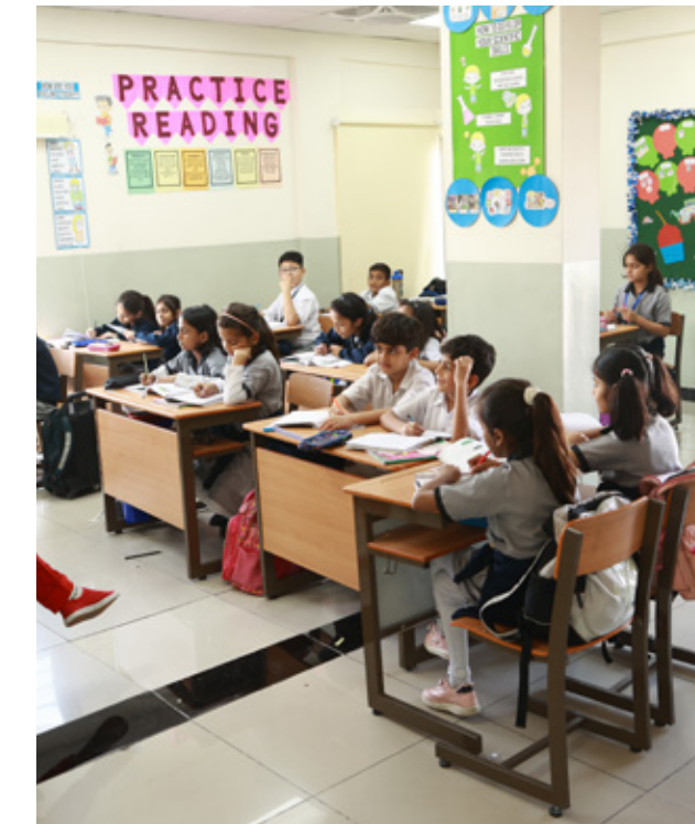
Education System, Bahria Town Karachi

Safety is a cornerstone of every Bahria Town community. With fire brigades and emergency response teams always ready, families are reassured they are protected. With well-planned road networks, efficient waste management, and comprehensive maintenance, we ensure a worry-free lifestyle that fosters residents' well-being.