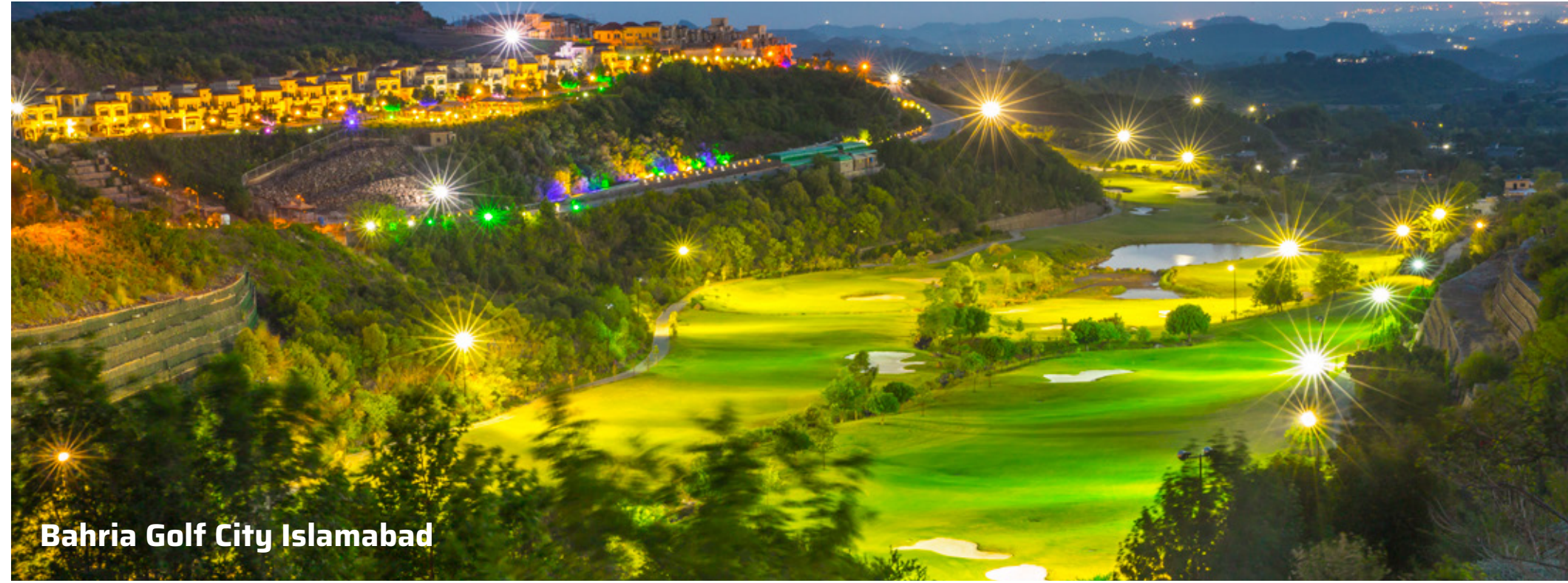
Bahria Golf City Islamabad