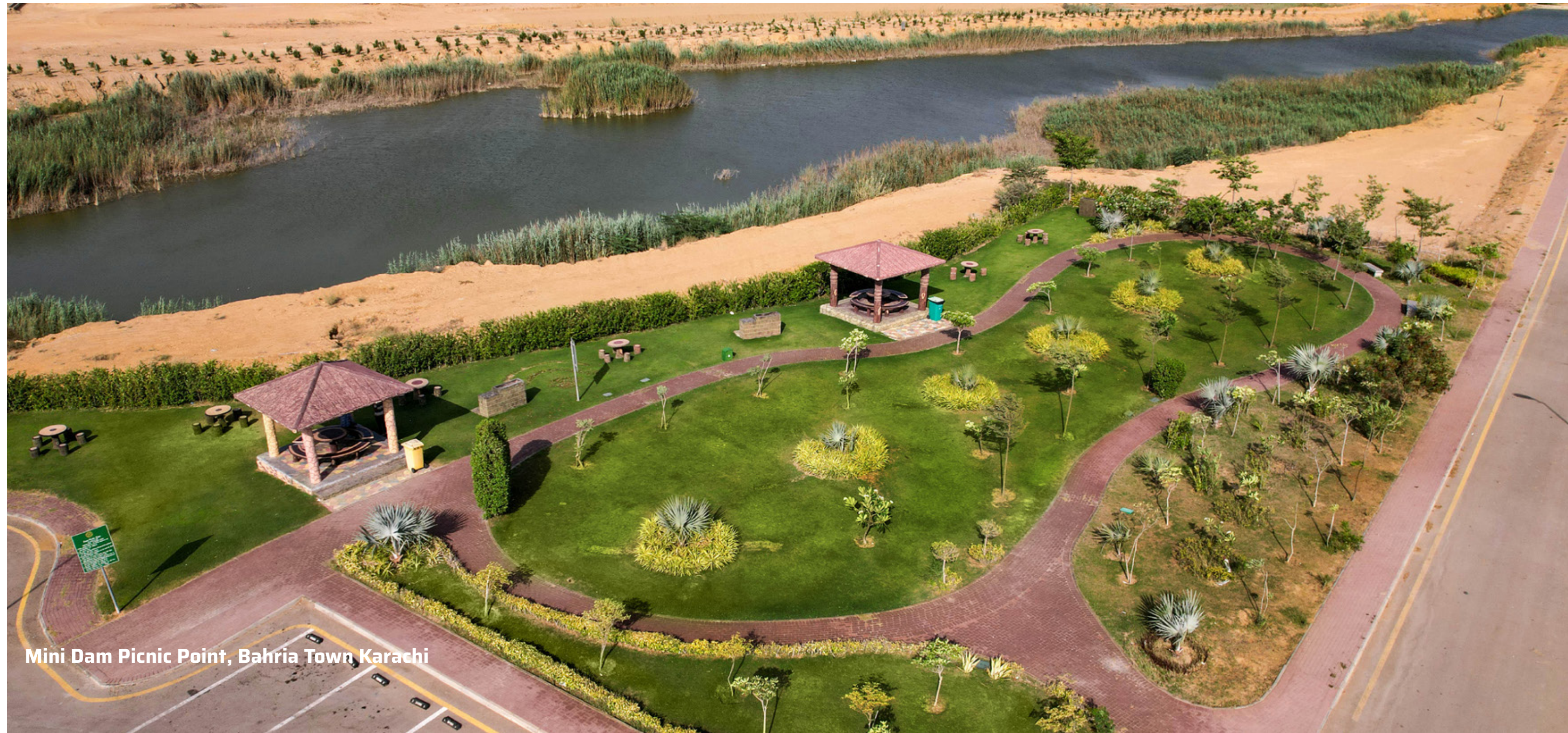
Mini Dam Picnic Point, Bahria Town Karachi

Water conservation is another focus, with mini dams managing rainwater to prevent floods and preserve groundwater for future generations. Our Urban Forestation initiative brings nature closer to home with tree plantation drives and green spaces that provide families with cleaner air and a healthier, more fulfilling living environment.