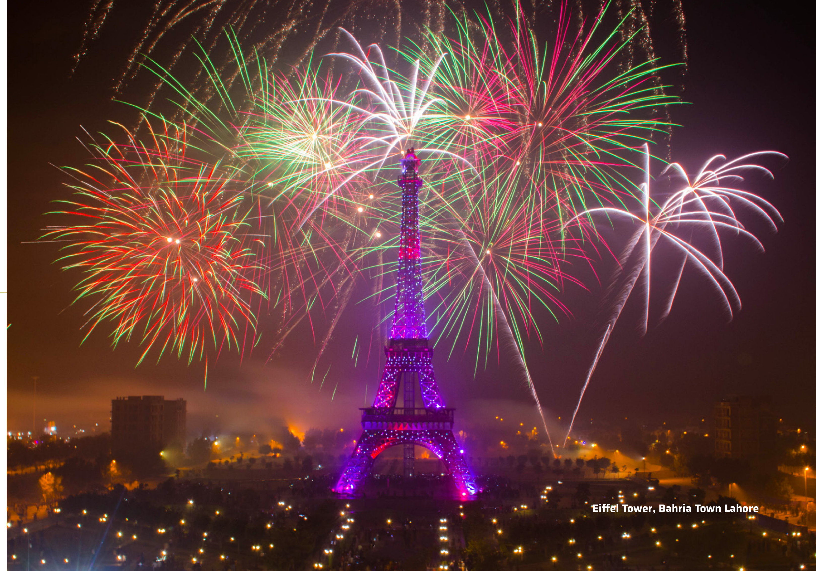
Eiffel Tower, Bahria Town Lahore