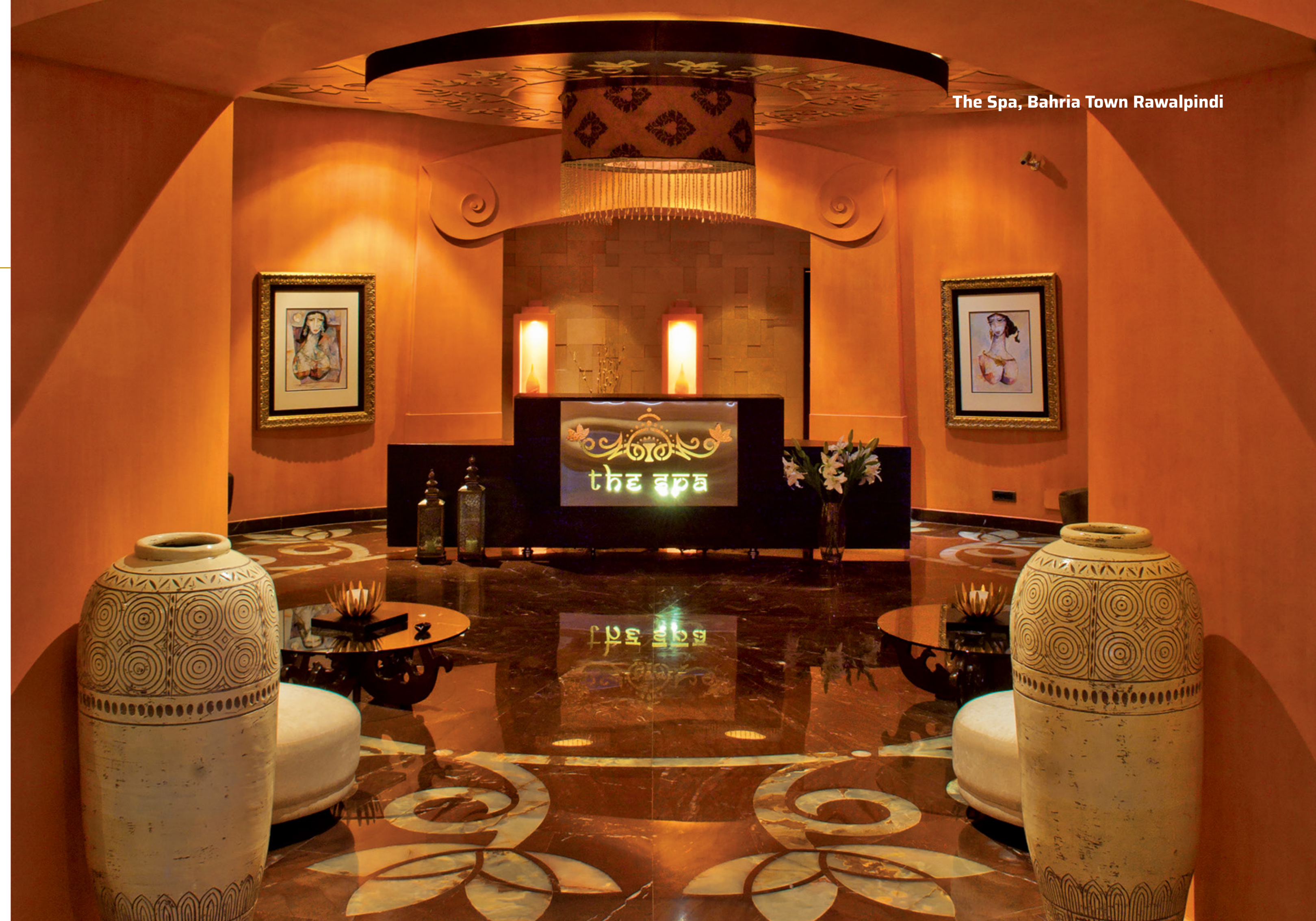
The Spa, Bahria Town Rawalpindi