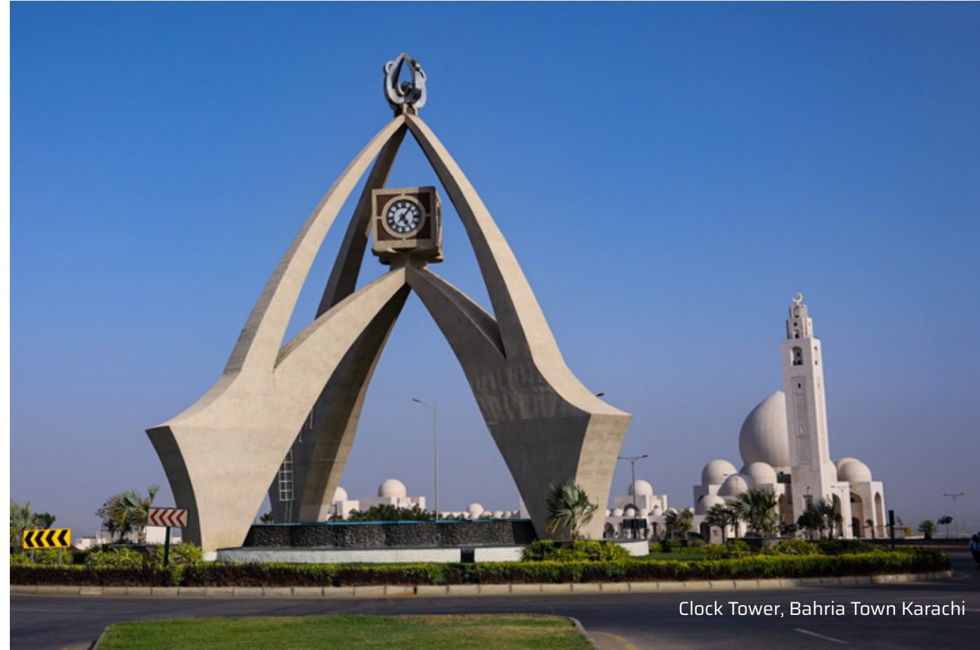
Clock Tower, Bahria Town Karachi

BT PROPERTIES IS PROUD TO BRING ITS LEGACY OF EXCELLENCE TO DUBAI, A CITY KNOWN FOR ITS ICONIC DEVELOPMENTS.