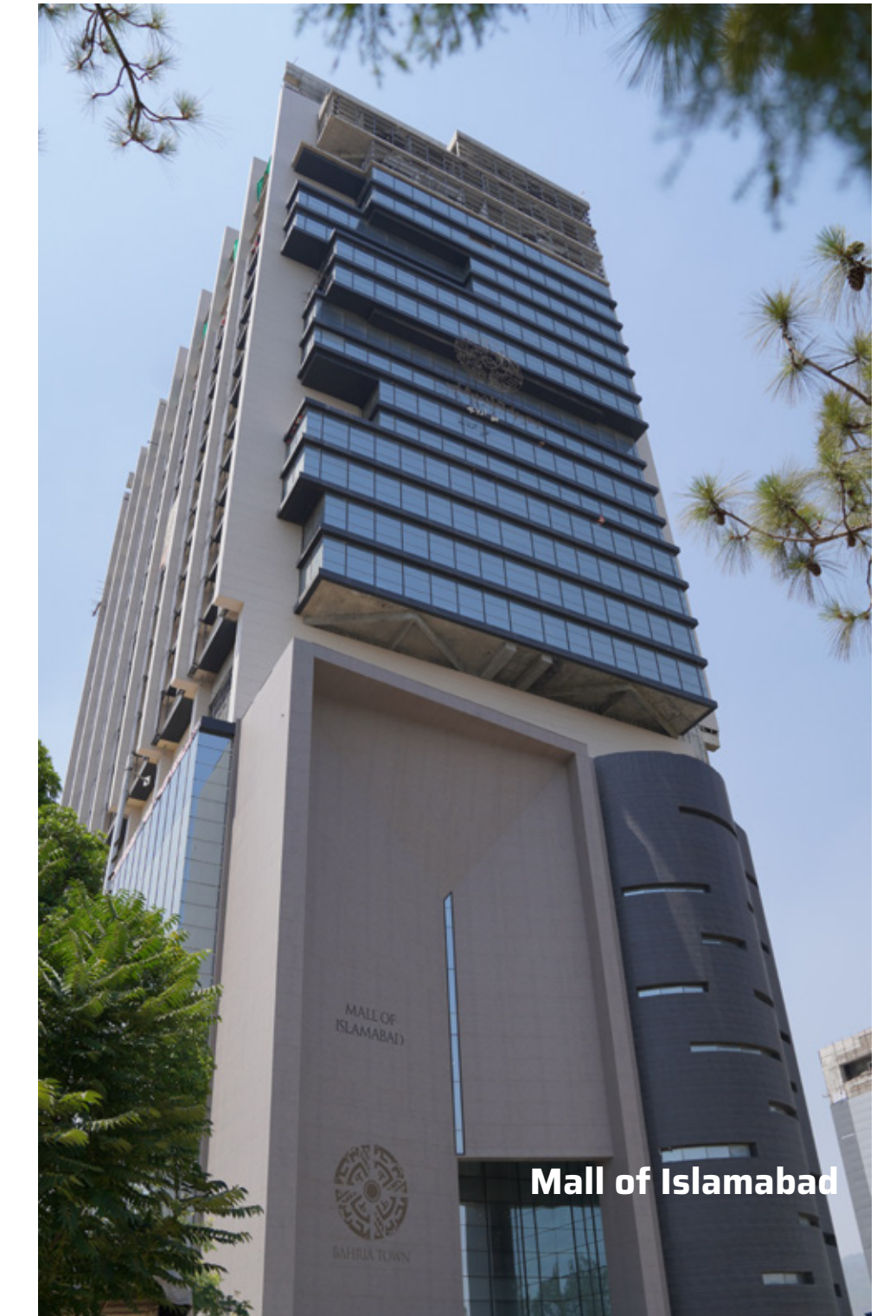
Mall of Islamabad