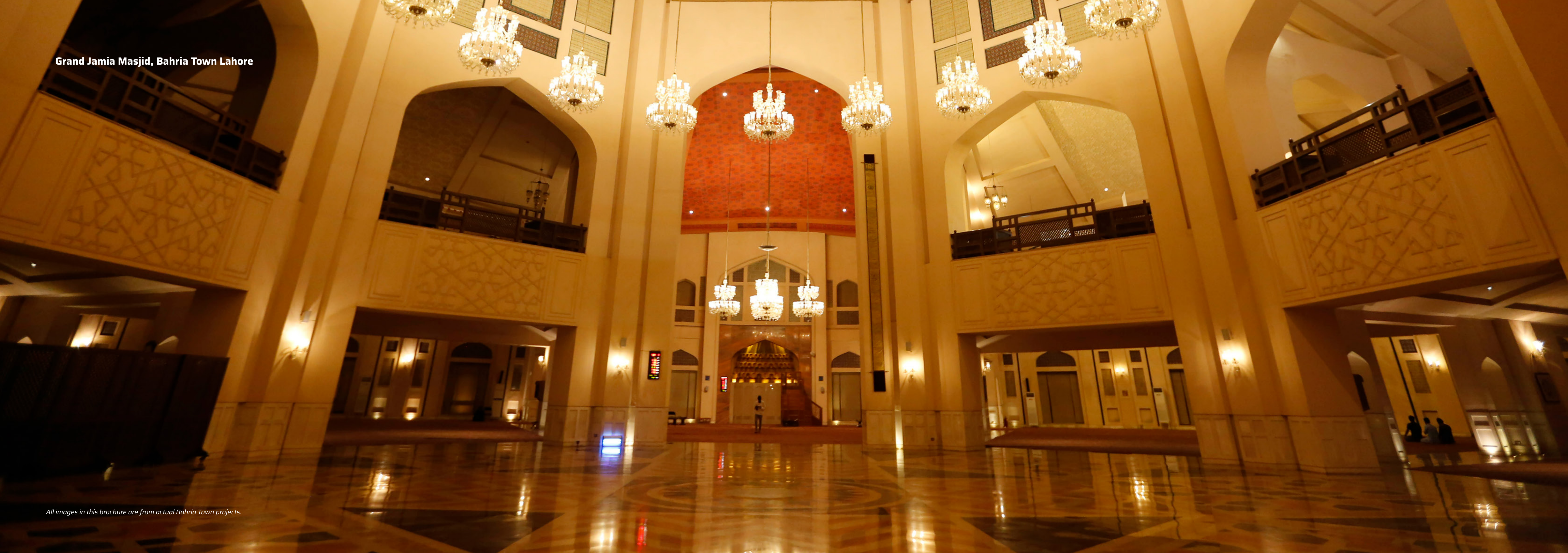
Grand Jamia Masjid, Bahria Town Lahore