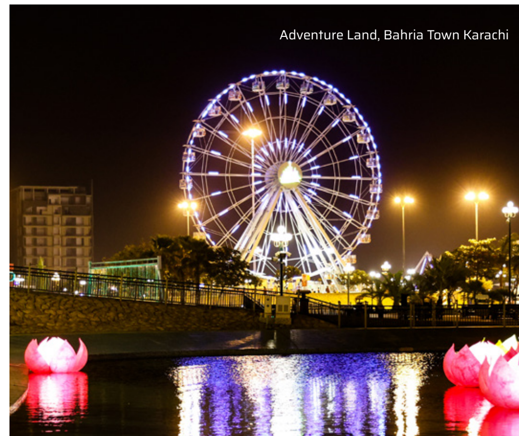
Adventure Land, Bahria Town Karachi

At BT Properties, we are enhancing Dubai's global reputation by delivering unmatched quality and setting new standards in urban living.