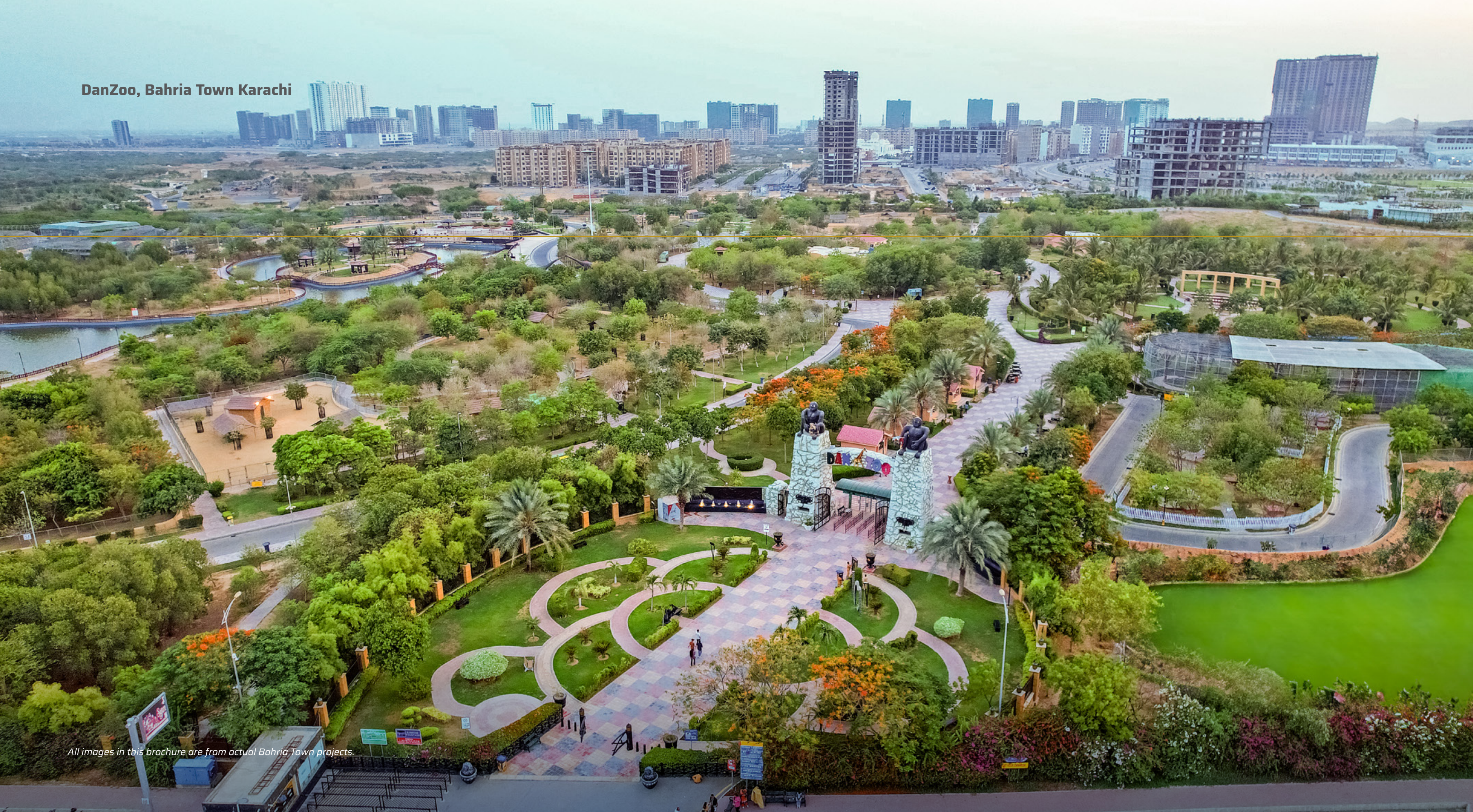
All images in this brochure are from actual Bahria Town projects.