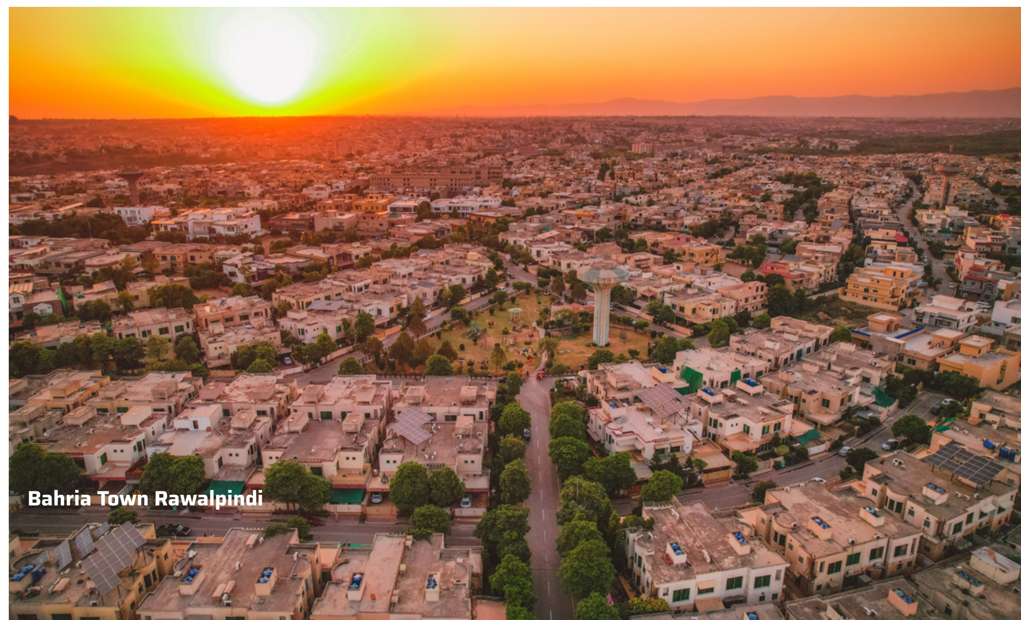
Bahria Town Rawalpindi

THE SAYING 'ROME WASN'T BUILT IN A DAY' HOLDS TRUE—UNLESS YOU'VE WITNESSED THE SPEED OF BT PROPERTIES' DEVELOPMENTS.