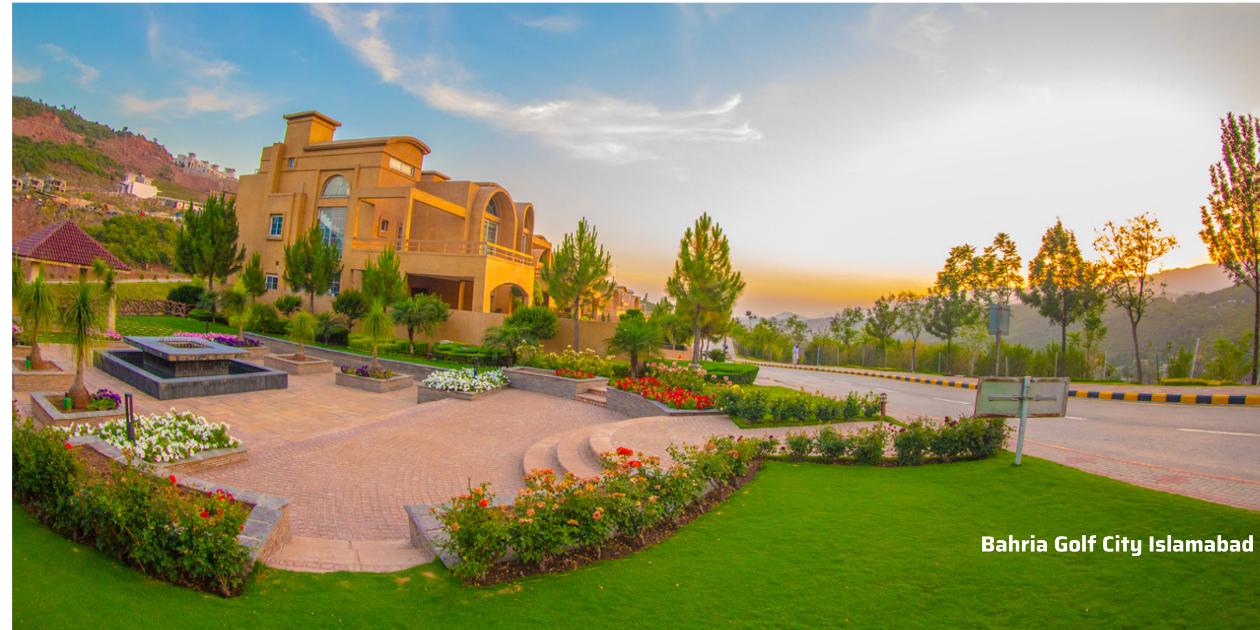
Bahria Golf City Islamabad