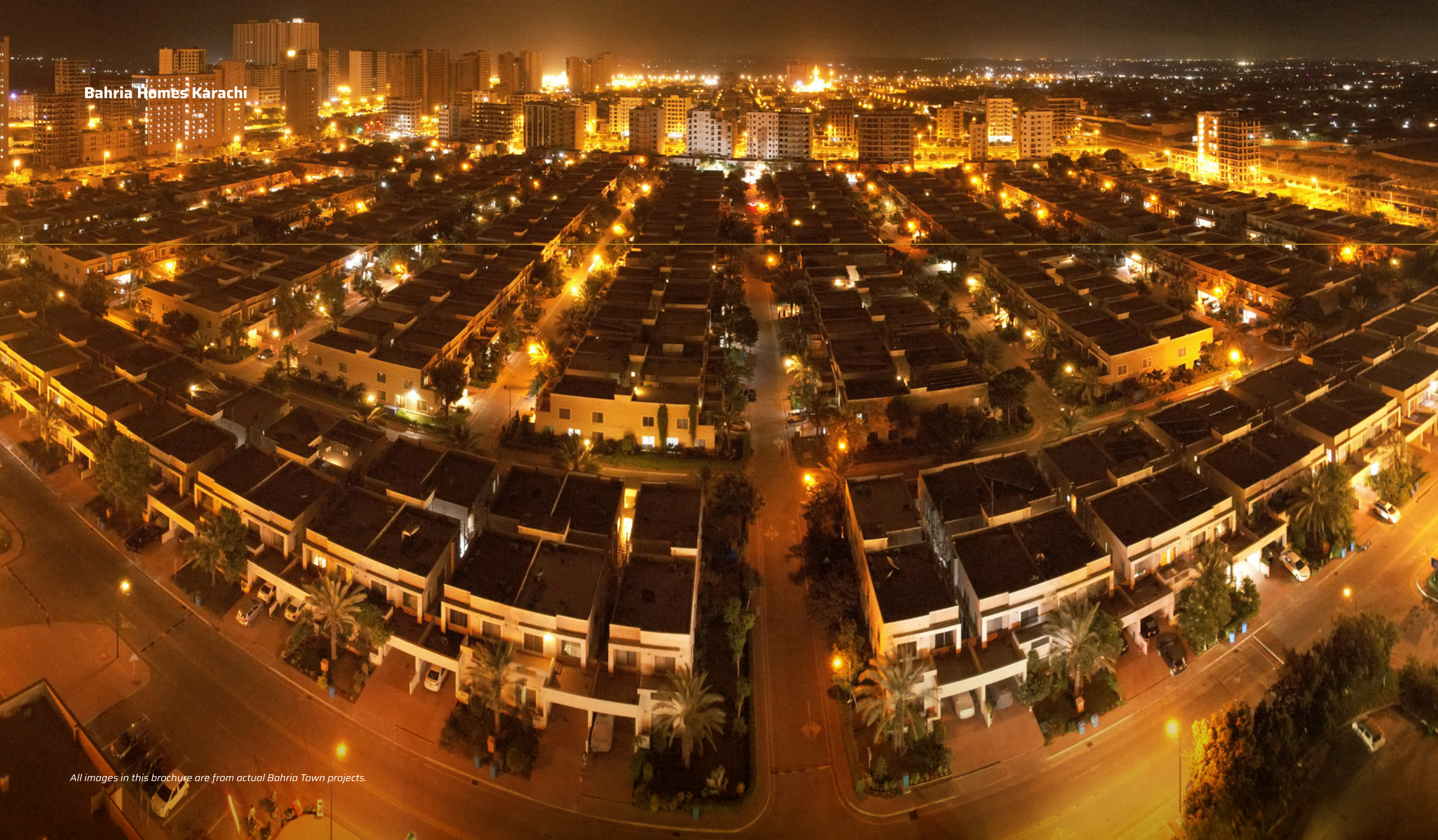
All images in this brochure are from actual Bahria Town projects.