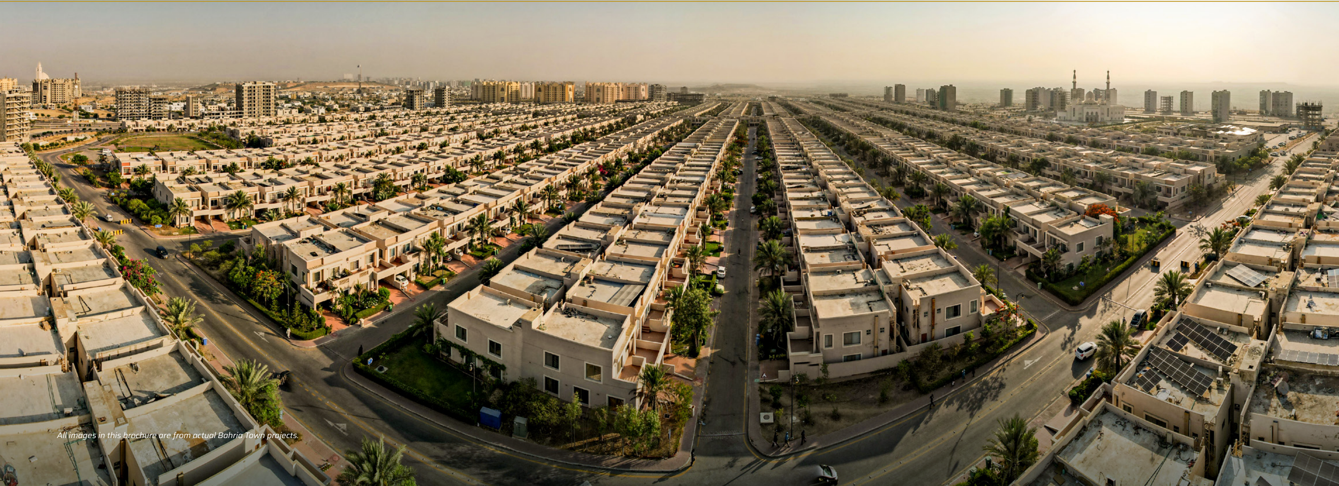
All images in this brochure are from actual Bahria Town projects.