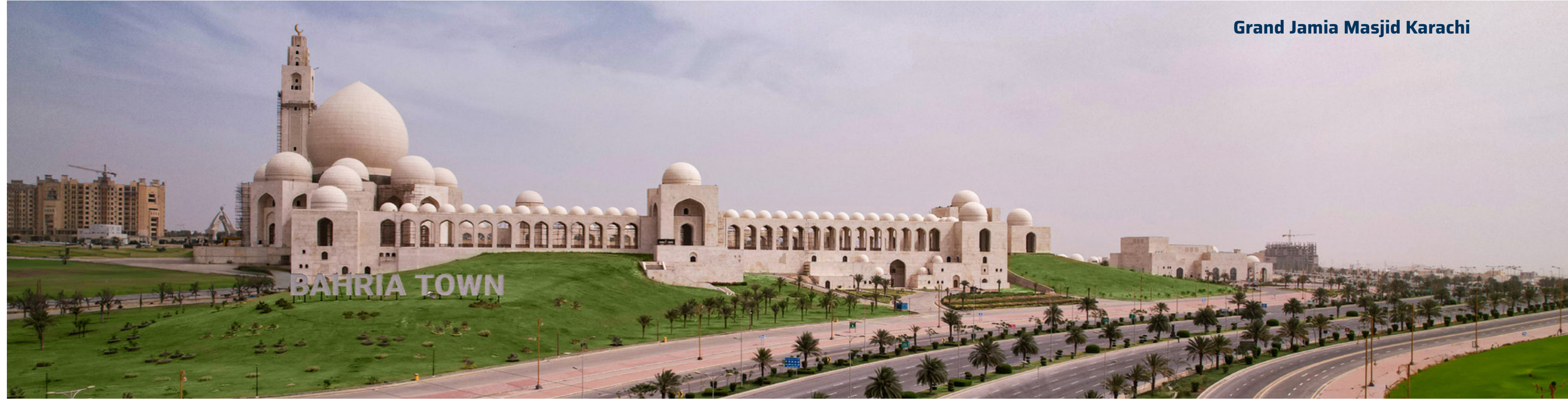
Grand Jamia Masjid Karachi

OUR EXPANSION INTO DUBAI ALIGNS WITH HIS HIGHNESS SHEIKH MOHAMMED BIN RASHID AL MAKTUUM'S DUBAI 2040'S VISION, FOCUSING ON WELL-CONNECTED COMMUNITIES THAT ENHANCE THE CITY'S GROWTH AND VIBRANCY.