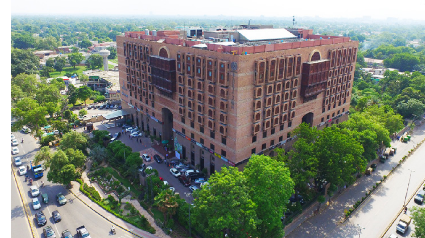
Mall of Lahore

Our state-of-the-art buildings represent a new era of luxurious living, merging advanced infrastructure with contemporary aesthetics. Each project is crafted precisely, offering a fully integrated lifestyle that combines residential, retail, and community spaces. With unparalleled amenities and cutting-edge design, we set the benchmark for future high-rise developments, delivering not just homes but complete living experiences in a class of their own.