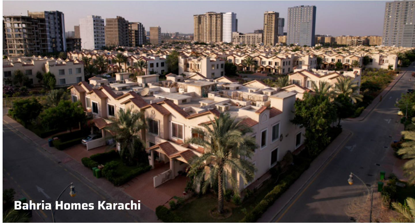
Bahria Homes Karachi