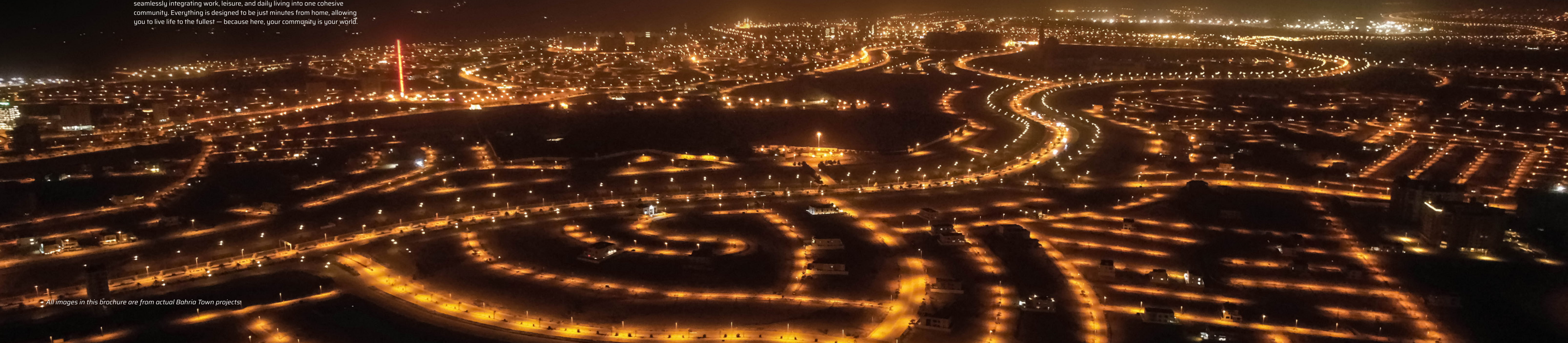
All images in this brochure are from actual Bahria Town projects

Our developments are designed for ultimate convenience and luxury, seamlessly integrating work, leisure, and daily living into one cohesive community. Everything is designed to be just minutes from home, allowing you to live life to the fullest — because here, your community is your world.