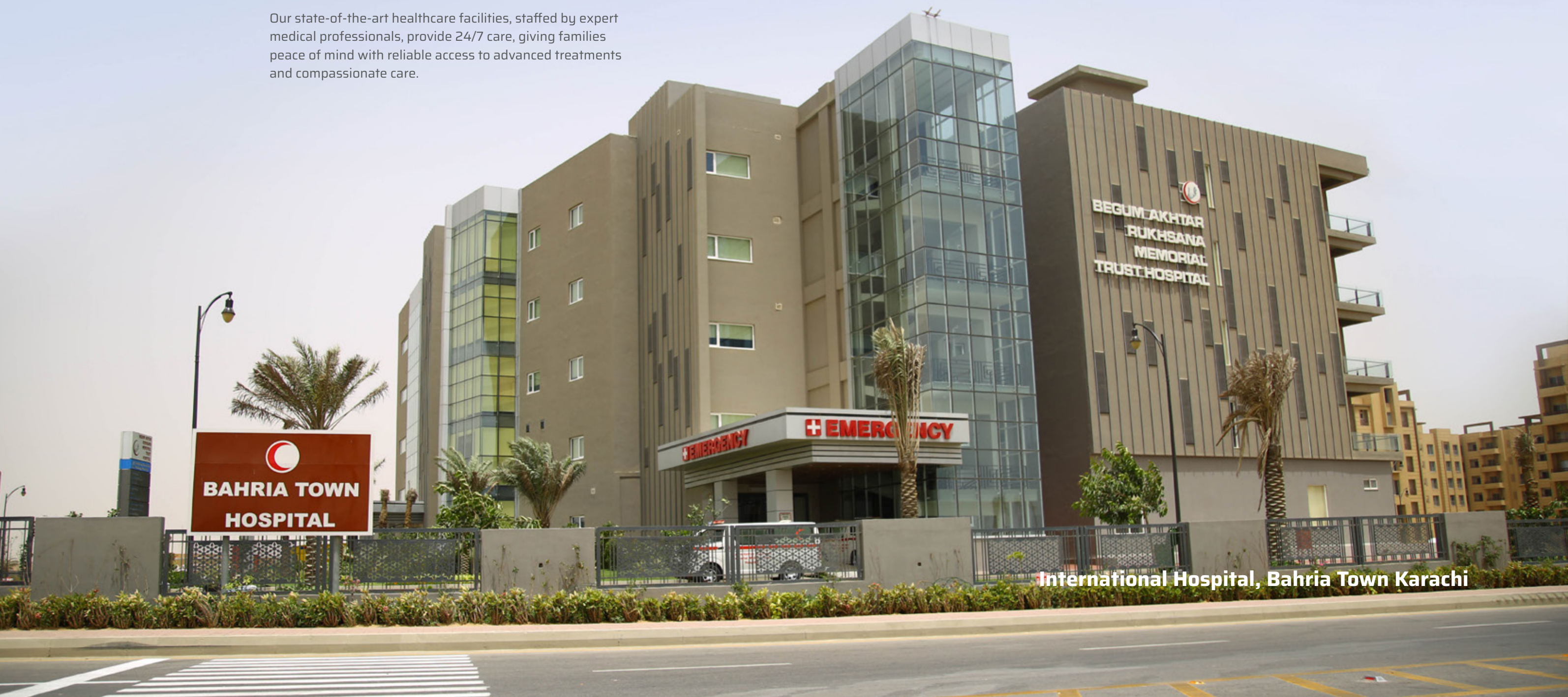
International Hospital, Bahria Town Karachi

Our state-of-the-art healthcare facilities, staffed by expert medical professionals, provide 24/7 care, giving families peace of mind with reliable access to advanced treatments and compassionate care.