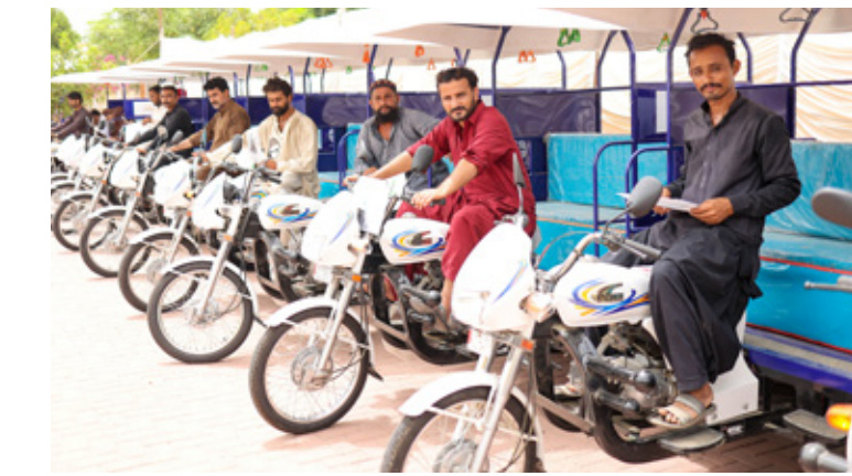
Rozgar Program - Bahria Town