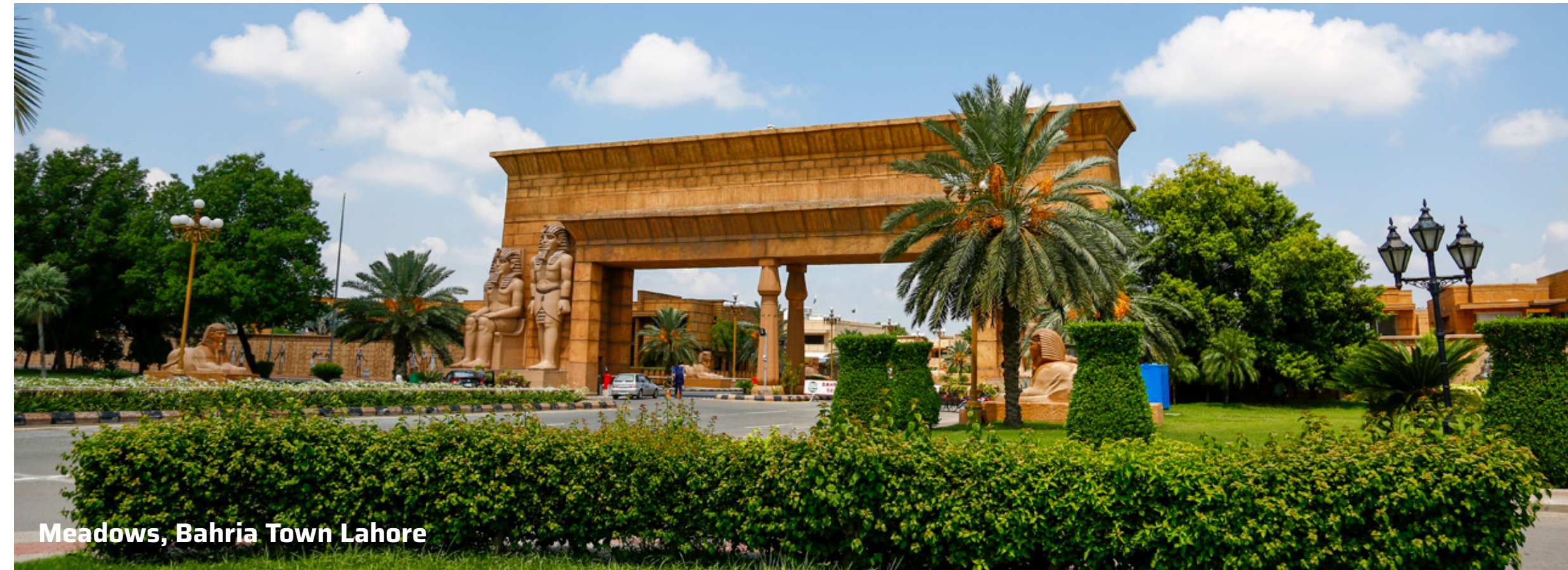
Meadows, Bahria Town Lahore